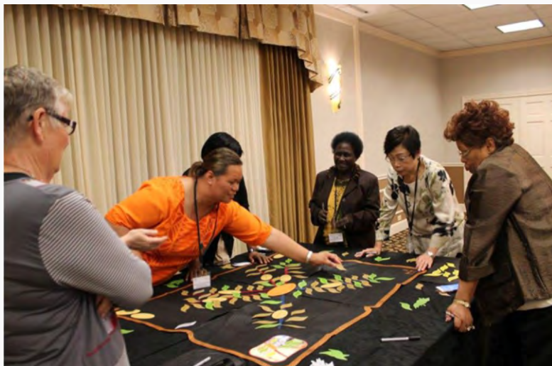
Photo of World Executive members using Ketso

At our World Executive meeting in Chicago in March, we used a resource called Ketso ( www.ketso.com ) and the