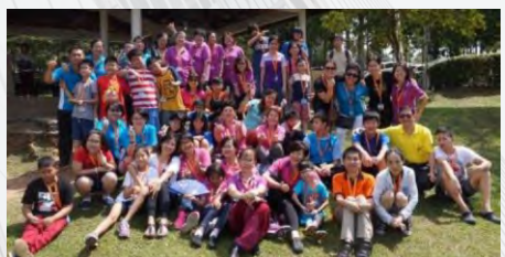
EAA Secretary at a Day Trip with the children

The Tamil Methodist Women's conference was held in late February 2017, with the topic "CHILDREN", relating to "The parable of the sower". The aim was to reach out to children from different backgrounds and to teach them the love of Jesus Christ.