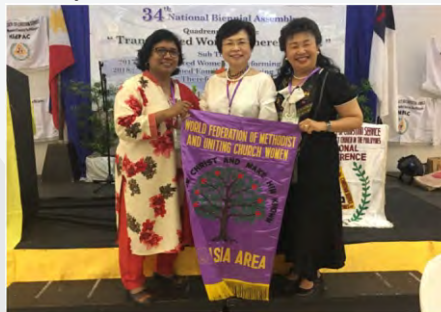
EAA Officers at the Assembly

simultaneously. The four-day Assembly ended with Closing Worship, Commitment Service and Holy Communion.