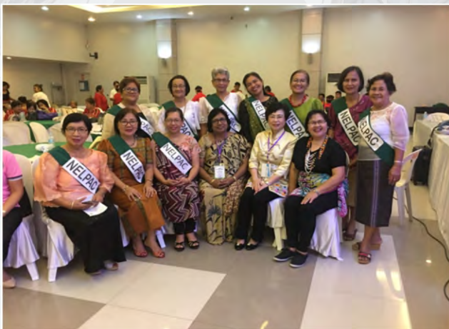
Philippines Annual Conference and EAA Officers

Three EAA officers attended the 34th National United Methodist Women's Society of Christian Service Assembly at The Subic Peninsular Hotel in the Philippines from 19th to 22nd April 2018. The Assembly theme was "Transformed Women, Therefore Go!" The Women's Society in the Philippines has been serving faithfully and diligently. Many families have been witnessing for Jesus Christ. In the region, they have helped the poor, empowered the oppressed and provided practical support to the socially disadvantaged. During the Assembly, the EAA officers had the pleasure of presenting the hymn "Blessed Assurance" in English, Chinese and Tamil