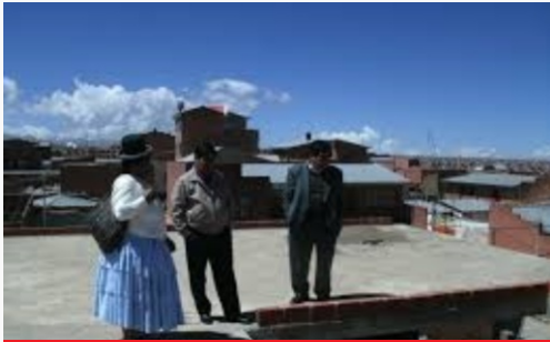
Tabita House, El Alto, La Paz, Bolivia

the British women, Tabita House now has a roof – and there is money to spare for buying equipment and resources for the centre. In November the women of the Isle of Man District had a wonderful time of fellowship as they got together to create panels for the Thursdays in Black global exhibit – a Waterfall of Solidarity and Resistance. Some of the women cut and sewed, others ironed, some kept the